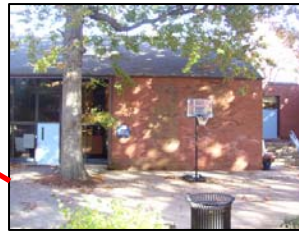
14. Lower School

*Located within Middle House: Burnham House Alumni Hall Gifford Sinclair Room