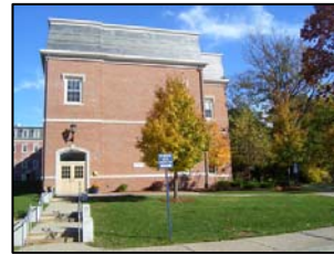
11. Ross House