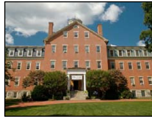
1. Middle House*

*Located within Middle House: Burnham House Alumni Hall Gifford Sinclair Room