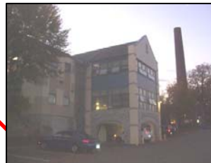
10. Upper and Lower Dwares